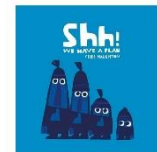
Shh We Have A Plan